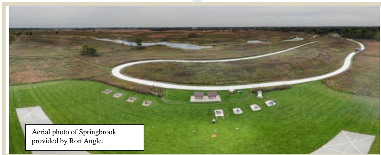
Aerial photo of Springbrook provided by Ron Angle.