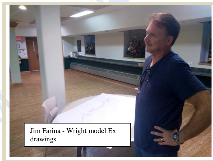
Jim Farina - Wright model Ex drawings.